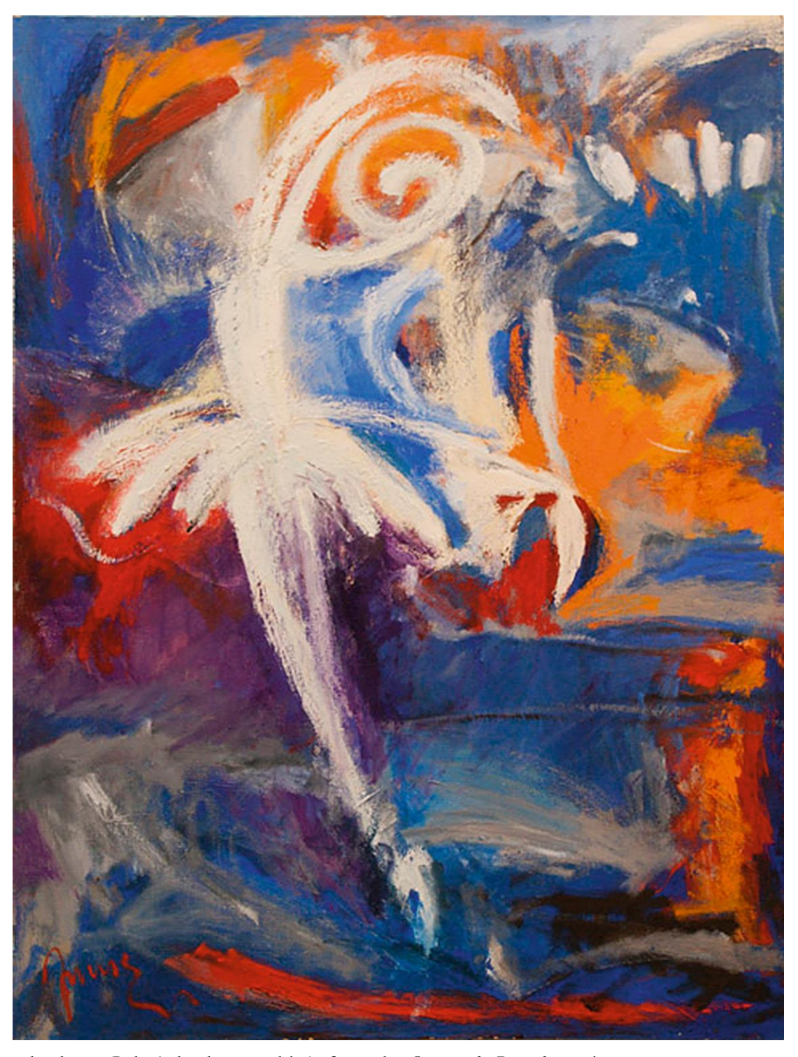
Khachatur Bely (Khachatur White), from the Sun on the Branches series, 2012, oil on canvas, 90\times70 cm