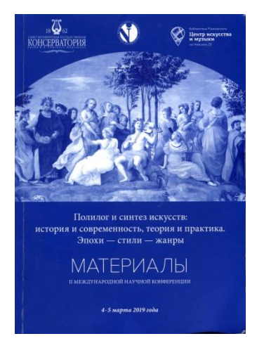
The original cover from the 2019 Russian Language edition

This book provides 97 abstracts of academic papers presented at the 2<sup>nd</sup> International Conference Polylogue and Synthesis of Arts: History and Modernity, Theory and Practice. Epochs – Styles – Genres , which took place on March 4–5, 2019 at the Rimsky-Korsakov Saint Petersburg State Conservatory, Russia. The original conference proceedings were published in 2019, and were subsequently translated into English and revised for the present edition. This series of conferences is planned to be continued annually in Saint Petersburg. So far, three such conferences took place (www.artpetropolis.com/konferencii) in 2018, 2019 and 2020, and each one had its proceedings published.