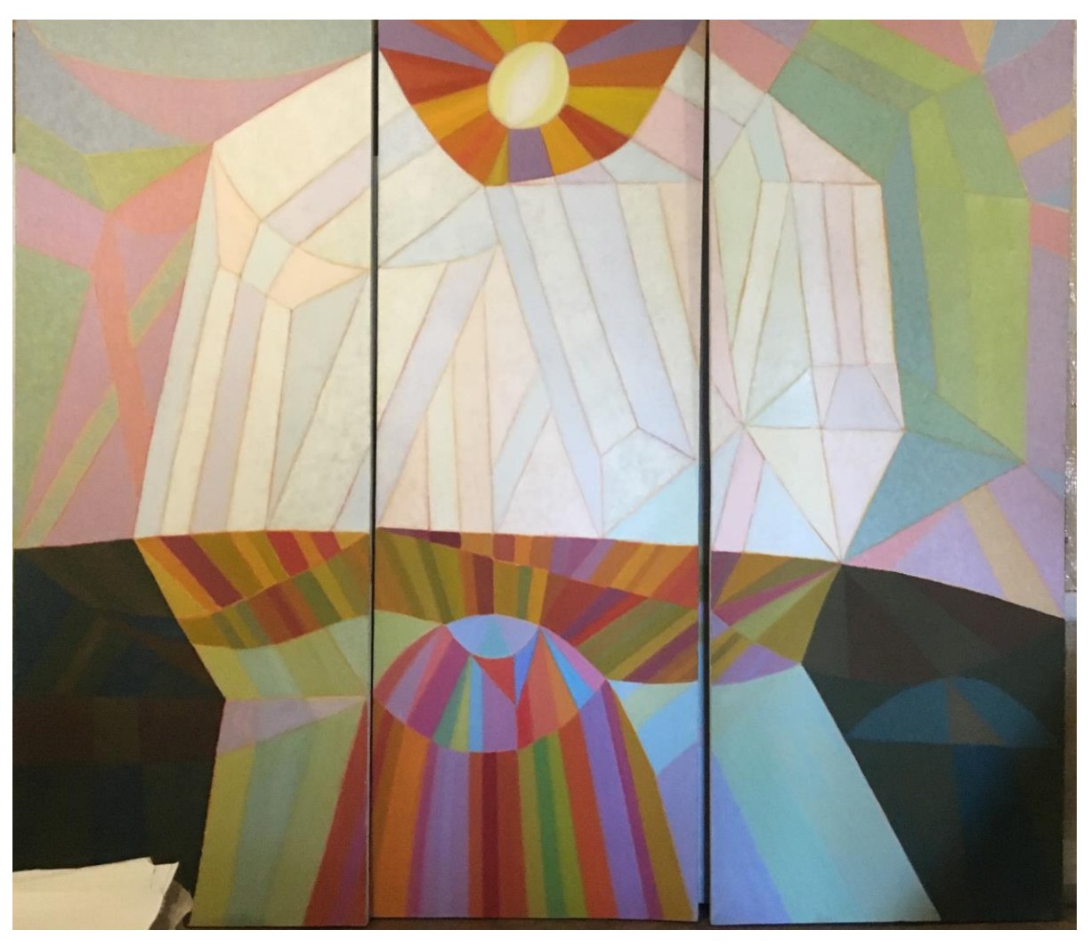
Gennady Zubkov, Still Life with Brushes, 1987, oil on canvas, 59×71 cm