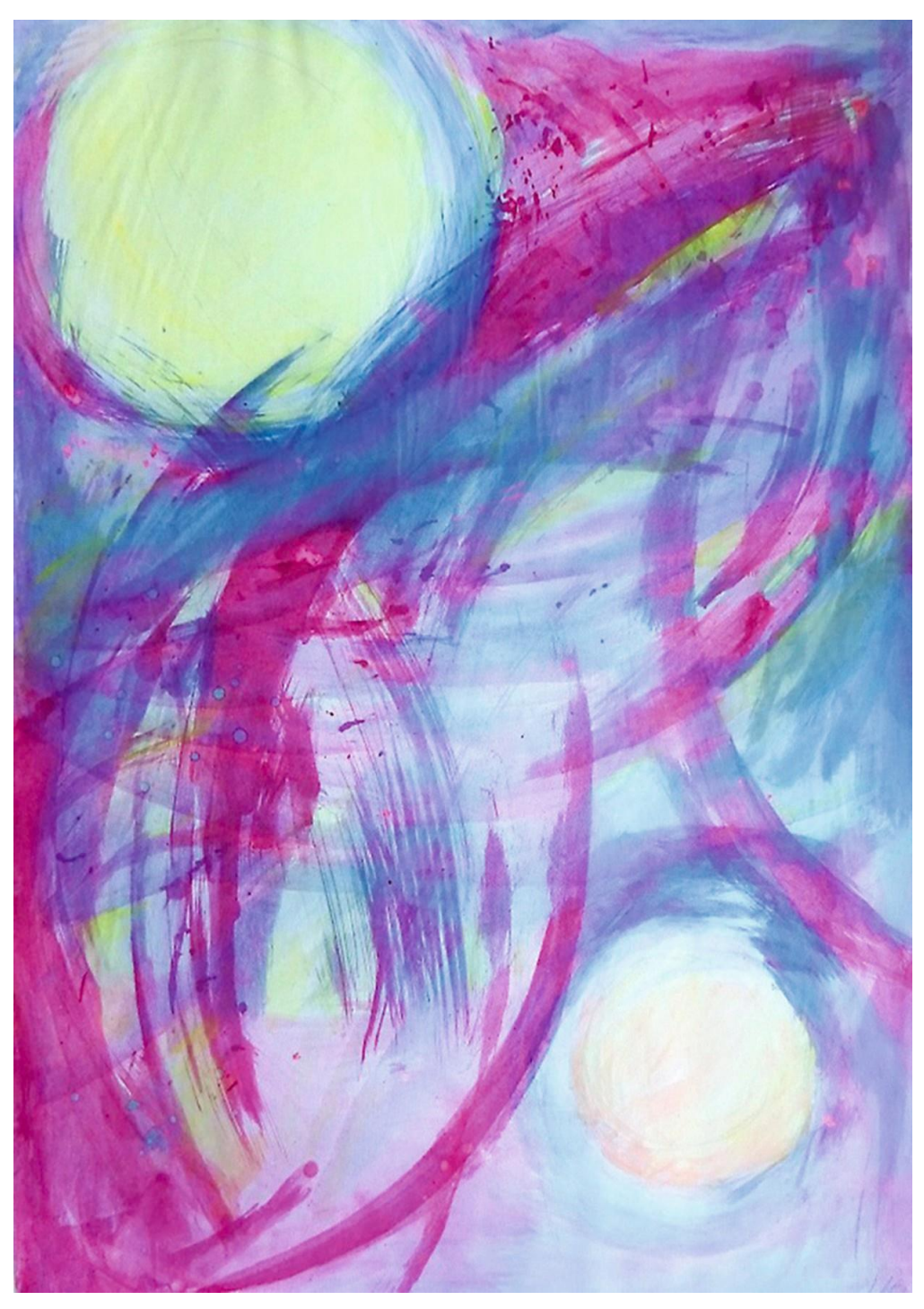
Katalina S'Bath, Two Suns, 2018, acrylic and organic dye on paper, 70×50 cm