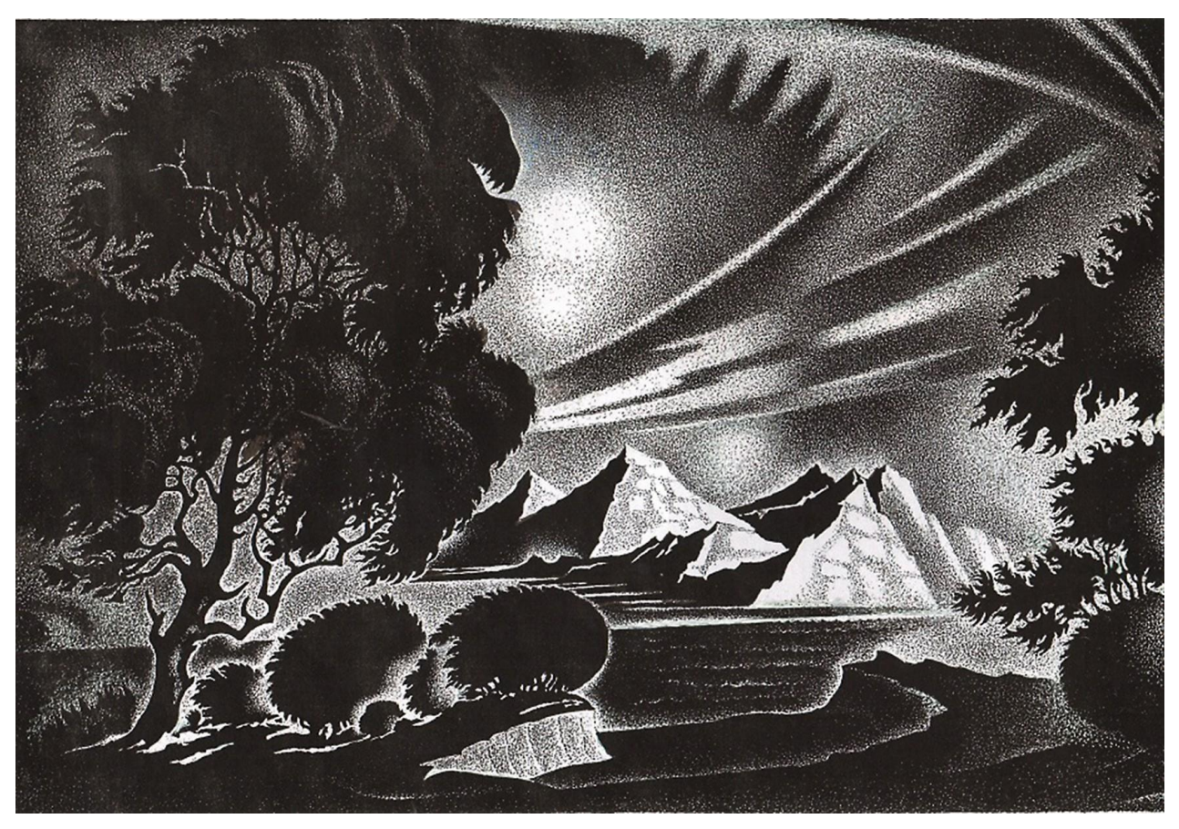
Victor Kurlandsky, Wind, 2018, cardboard, author's technique, 40×60 cm