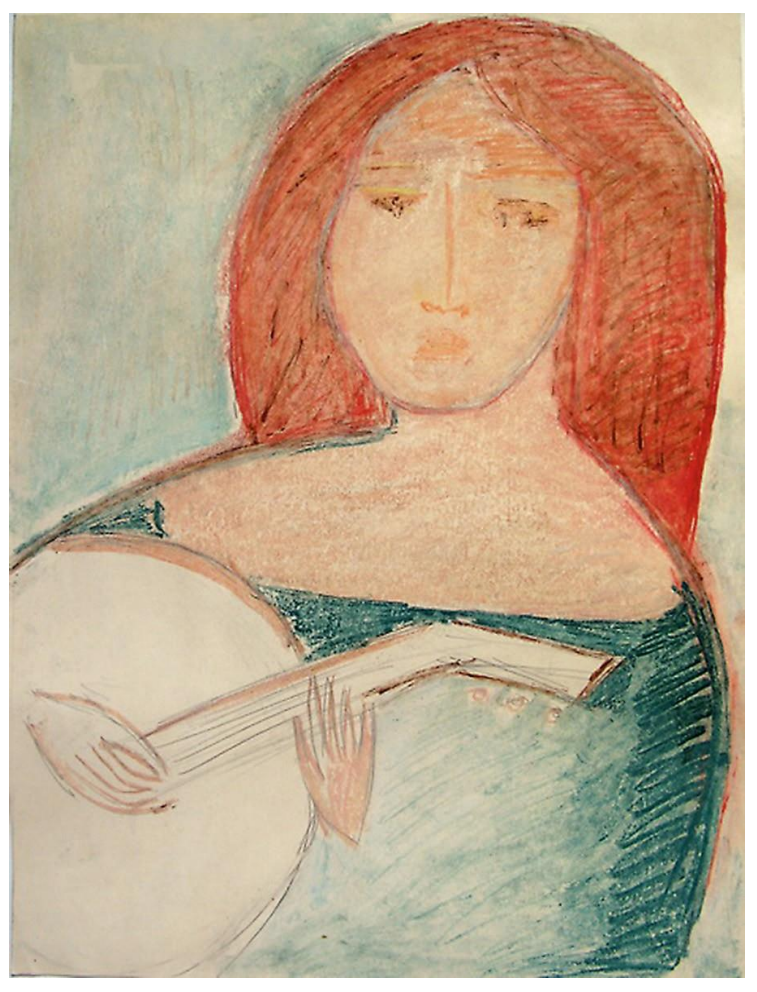
Svetlana Moskovskaya (Svetlana Konanchuk), \textit{The Girl with the Mandolin}, 2009, cardboard, pastel, 90\times70~cm