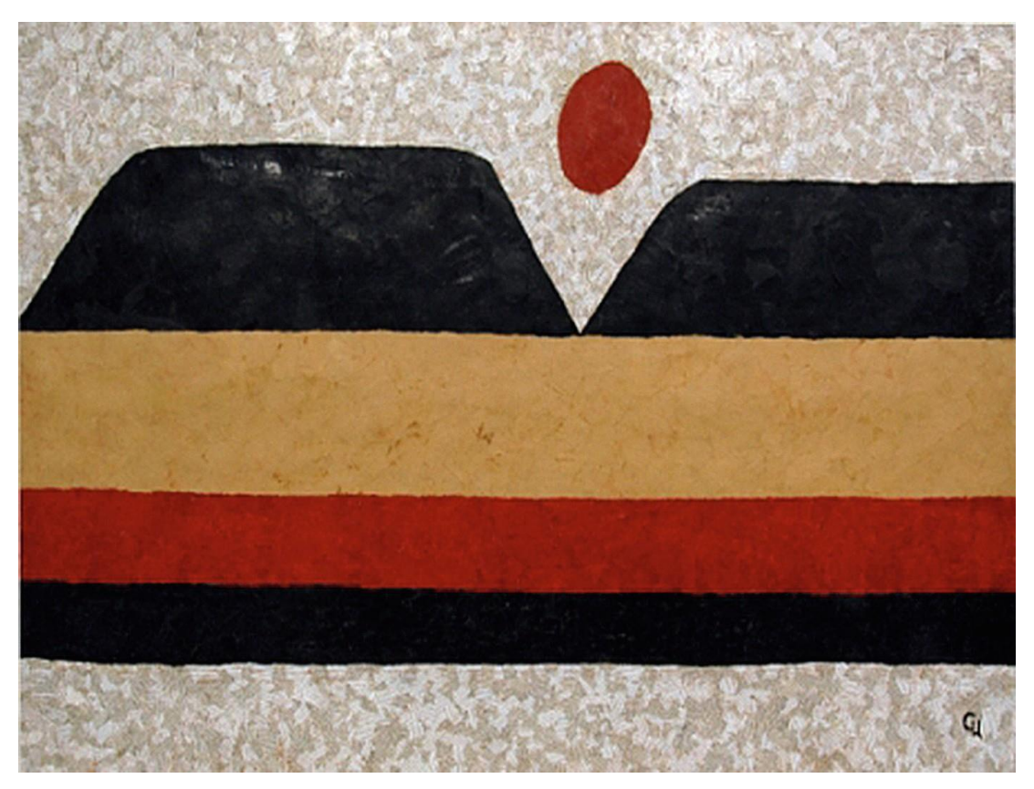
Svetlana Tsvirkunova, Philippine Landscape , 2008, H. smesh. Techn., 100\times150~\mathrm{cm}