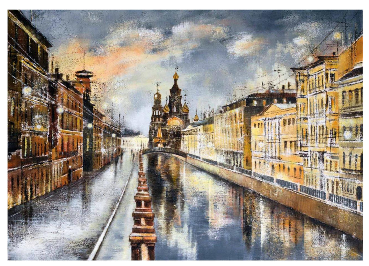
Ottilie Gruber, Saint Petersburg, 2015, oil on canvas, 50×70 cm